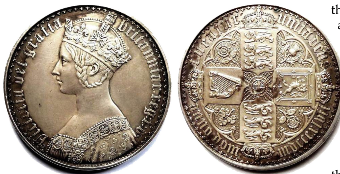
AR Crown, 1847, engraved by William Wyon

Victoria dei gratia britanniar: reg: f:d: Crowned bust, with braided hair; the dress embroidered with roses, shamrocks and thistles. W.W. incuse on the truncation below the shoulder.