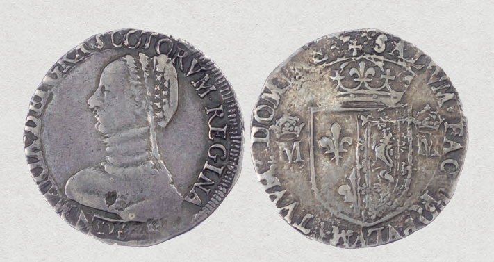
1562 Mary Testoon, Scotland. (S5422). GF, extremely rare.