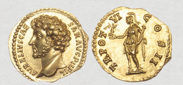
Marcus Aurelius Gold Aureus (RIC 452d). NGC MS. Strike 5/5, Surfaces 4/5.