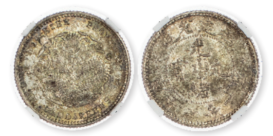
Lot 382 China Fukien silver 10 Cents coin broke a world record and sold for an astounding £4,800.