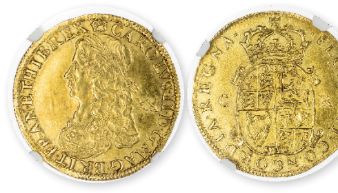
Lot 185 Charles II Unite coin sold for £26,000, exceeding its estimated value.