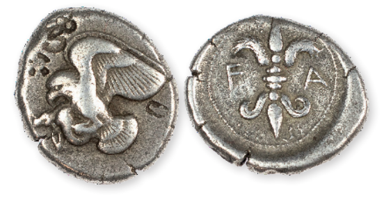
Lot \ 29 Elis, Olympia AR Stater sold for a respectable hammer price of £3,200, further proving the demand for ancient and rare