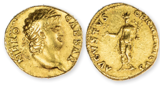
Lot 49 Nero AV Aureus sold for £5,000, a testament to its historical and collectible value.