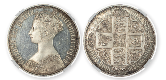
Lot 282 Victoria Proof Gothic Crown sold for an impressive £33,000, also exceeding its estimated value.