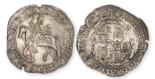
Lot 176 Charles I Halfcrown achieved a hammer price of £11,000, well above its estimated value.